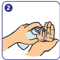
Take sufficient amount of Soft Care® Sandalwood handwash on your hands.