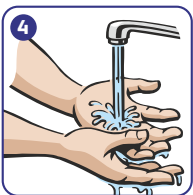
Rinse hands thoroughly. Remove all traces of lather.