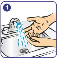
Wet your hands.

Soft Care® Sandalwood perfumed gentle hand cleanser is ready-to-use. It can be easily dispensed through any refill / top-fill dispensers.